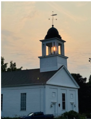
Early morning at NYCC